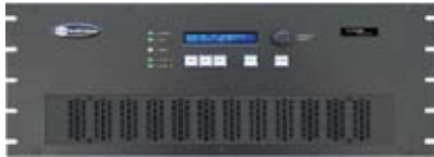
Linx 1600 DVI Matrix Switcher

* While the advertised performance has been demonstrated, actual performance depends on the performance of the customer's network.